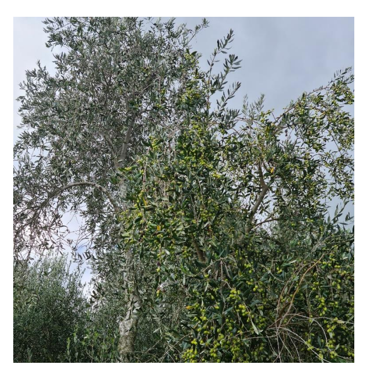
Two state tree at Olives on the Hill