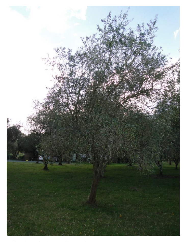
Bella Olea is looking really good