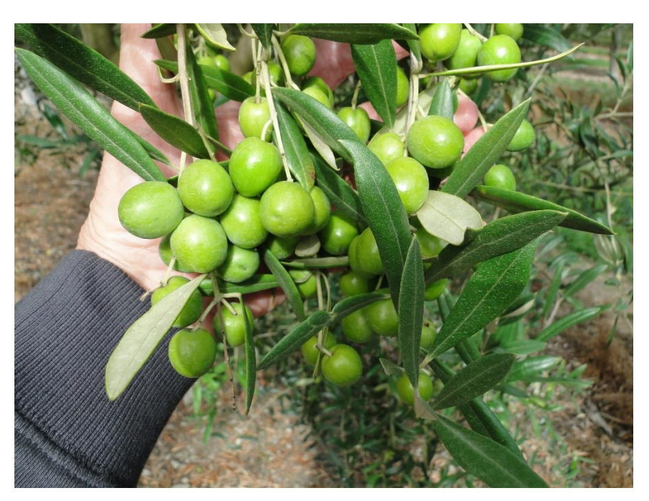
Even more beautiful bunches