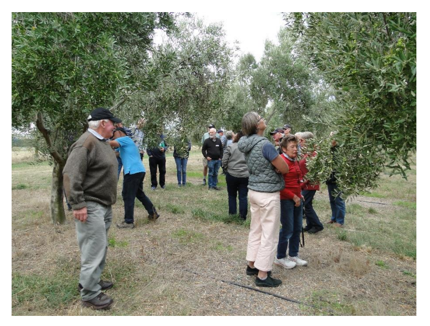
Admiring the crop