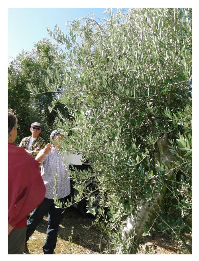
Stuart explains cuts for bushy regrowth