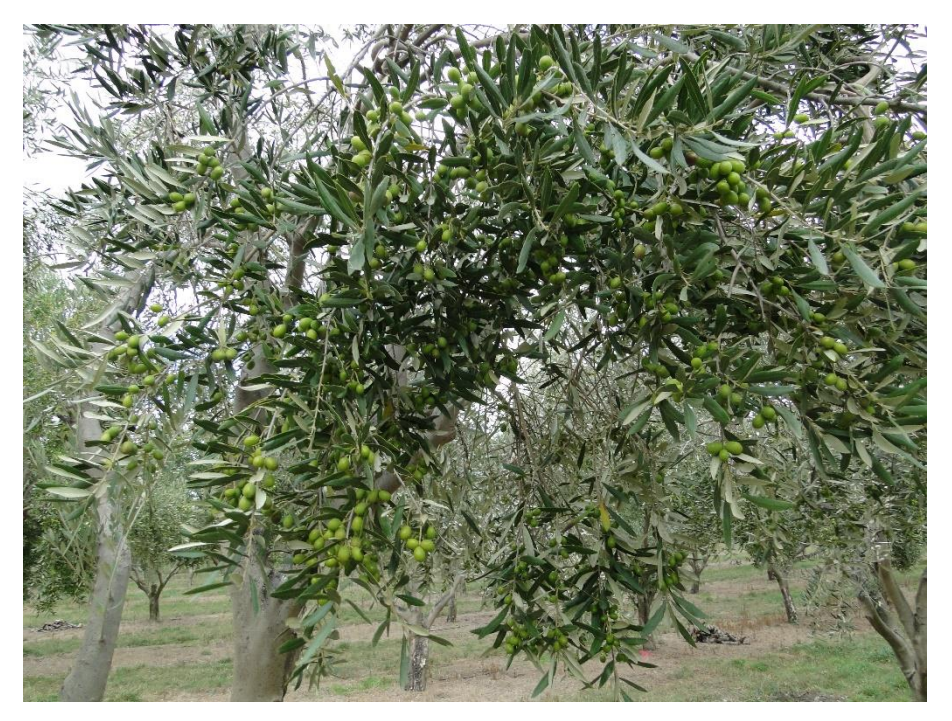
Typical laden branch at Terrace Edge