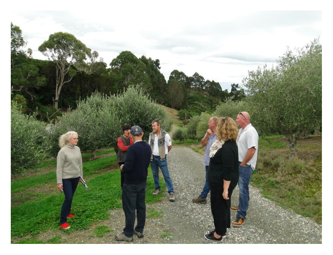
In the grove at Neudorf