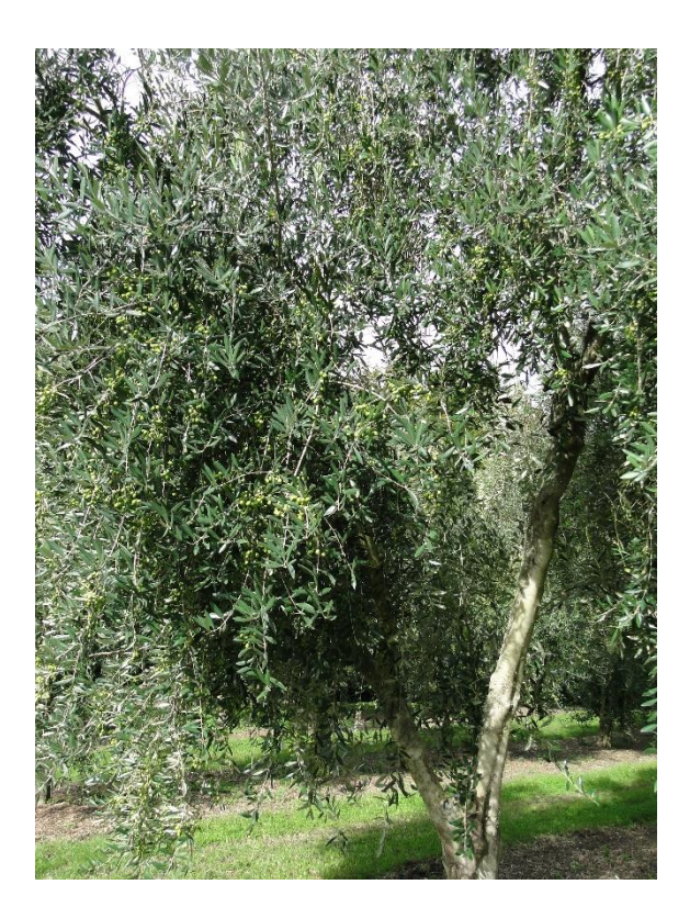
Typical laden tree