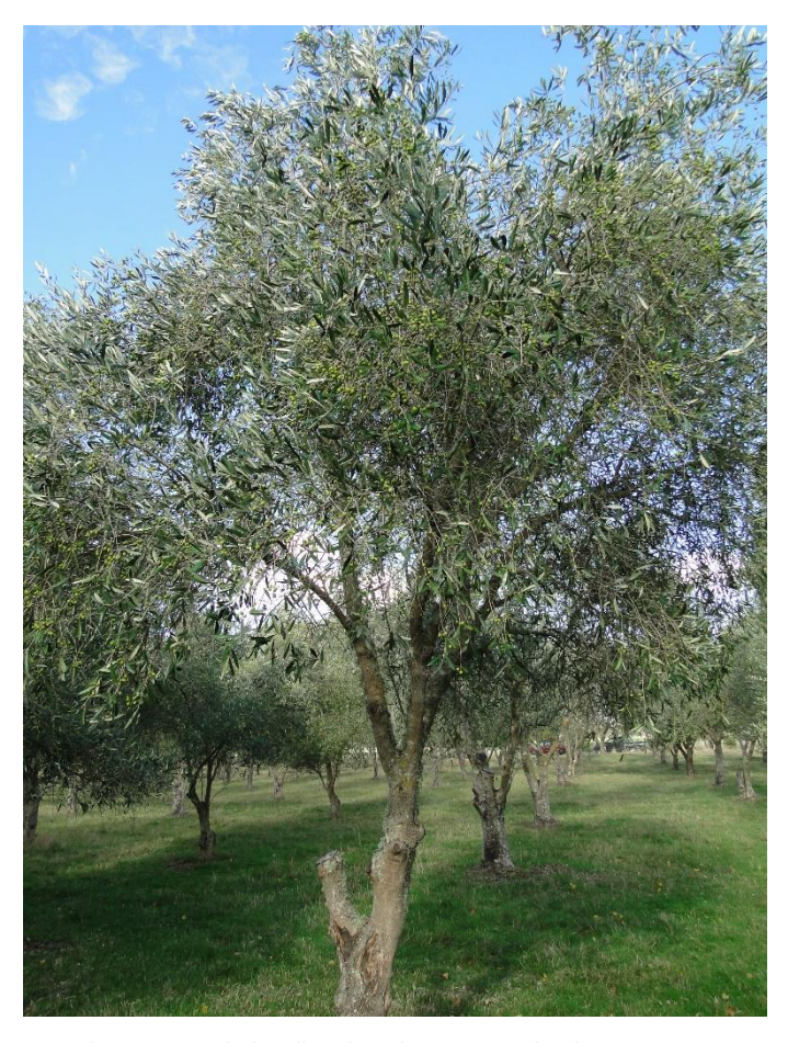
Trees have responded well with a pleasing crop load