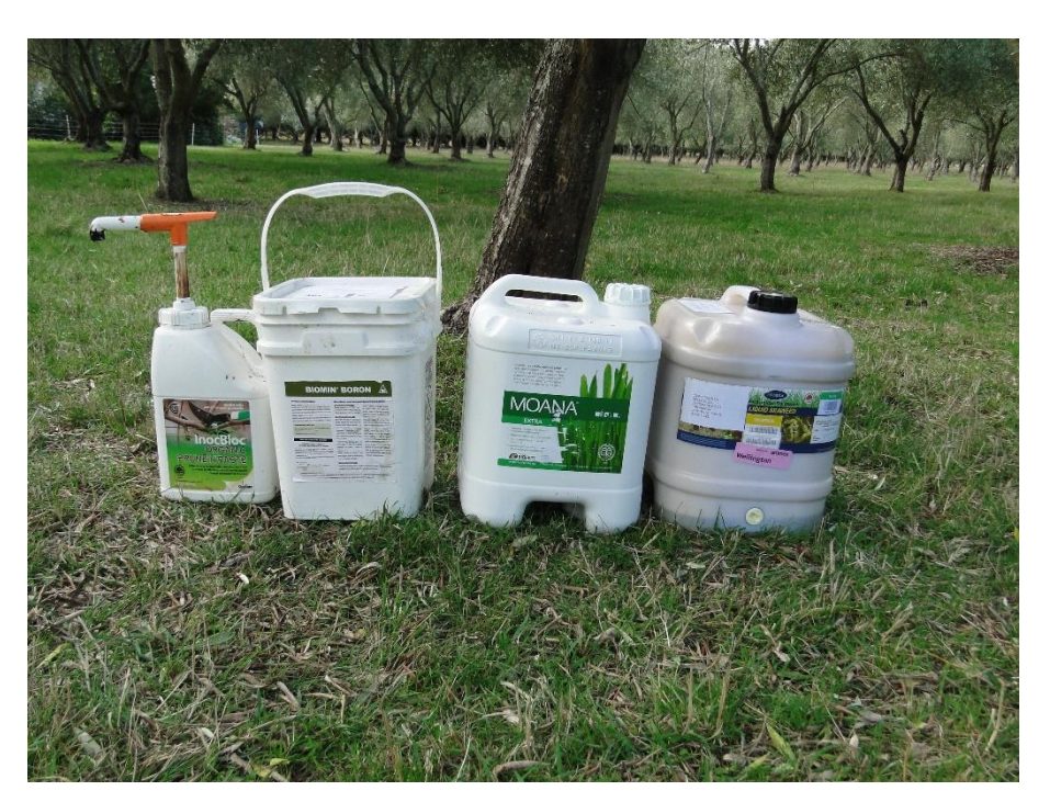
Products being used at Bella Olea