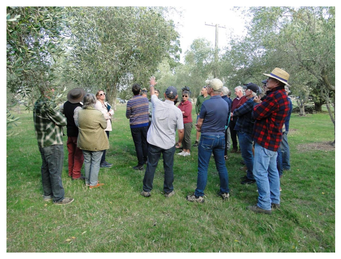
Out in the grove at Bella Olea