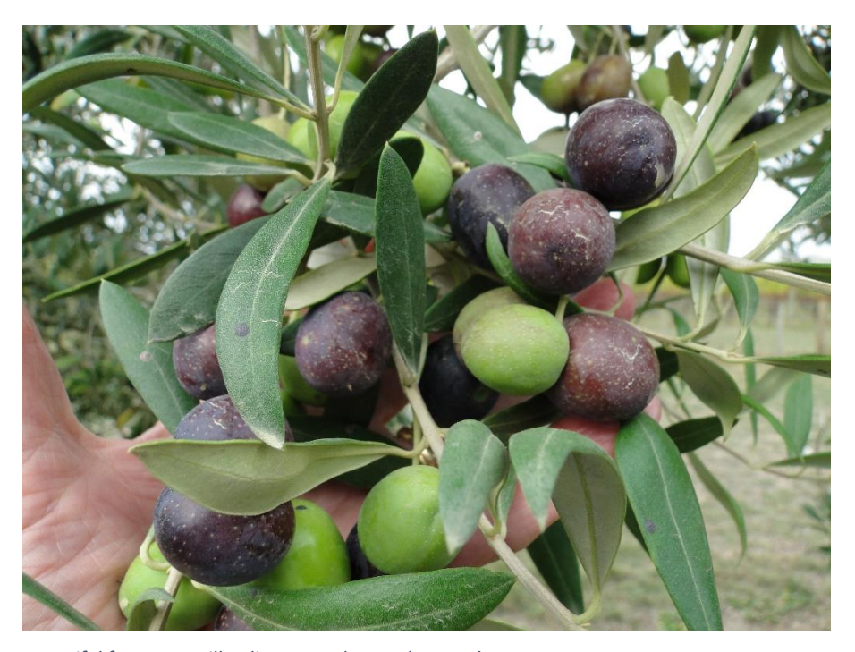
Beautiful fat Manzanilla olives - good enough to eat!