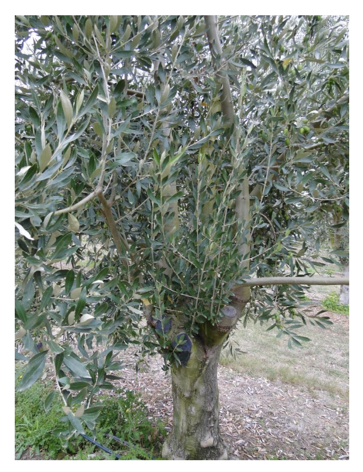
Vigorous new growth