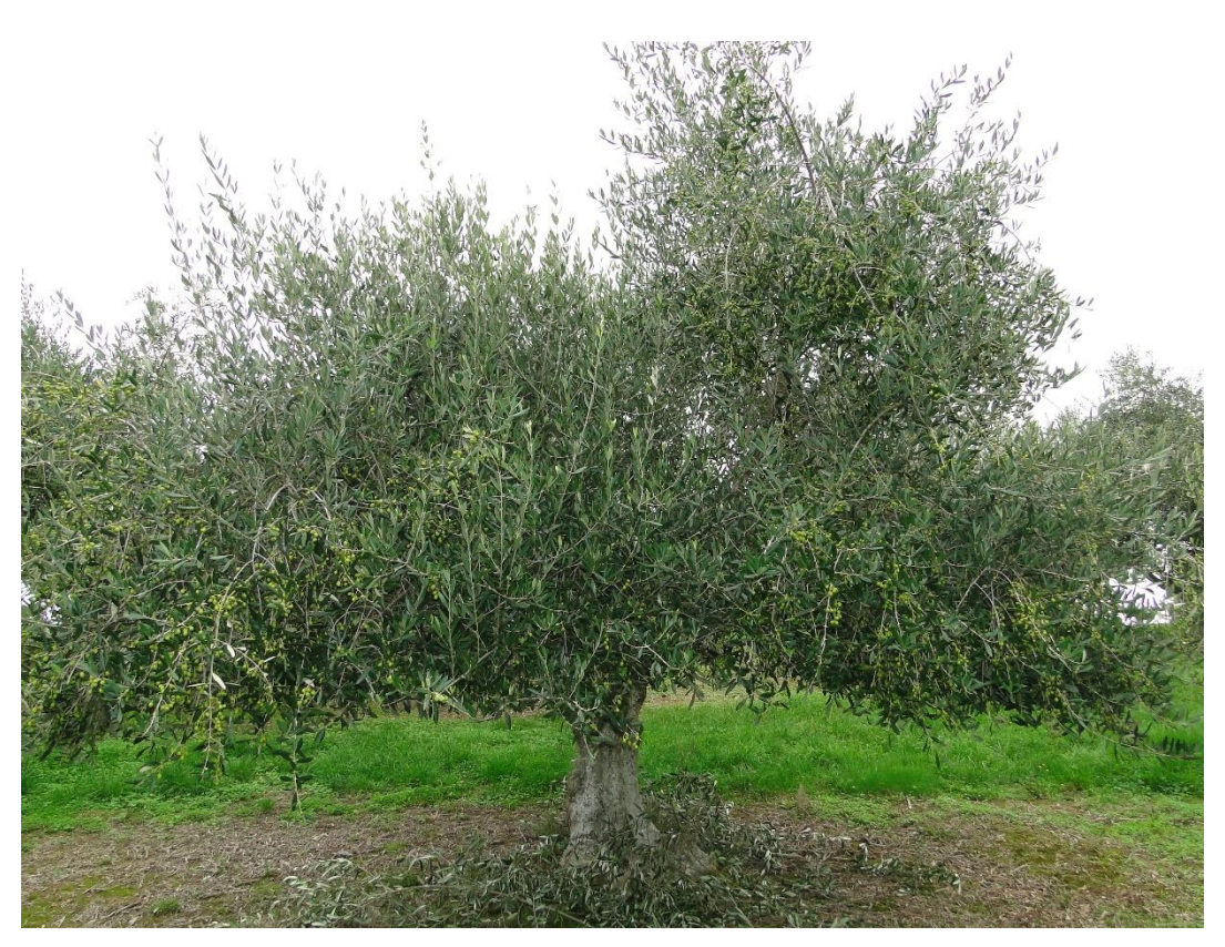
Ideally pruned for hand harvest