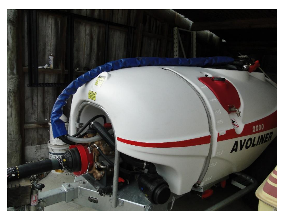
The new sprayer