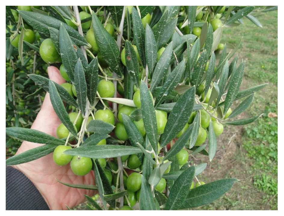
Beautiful plump bunches