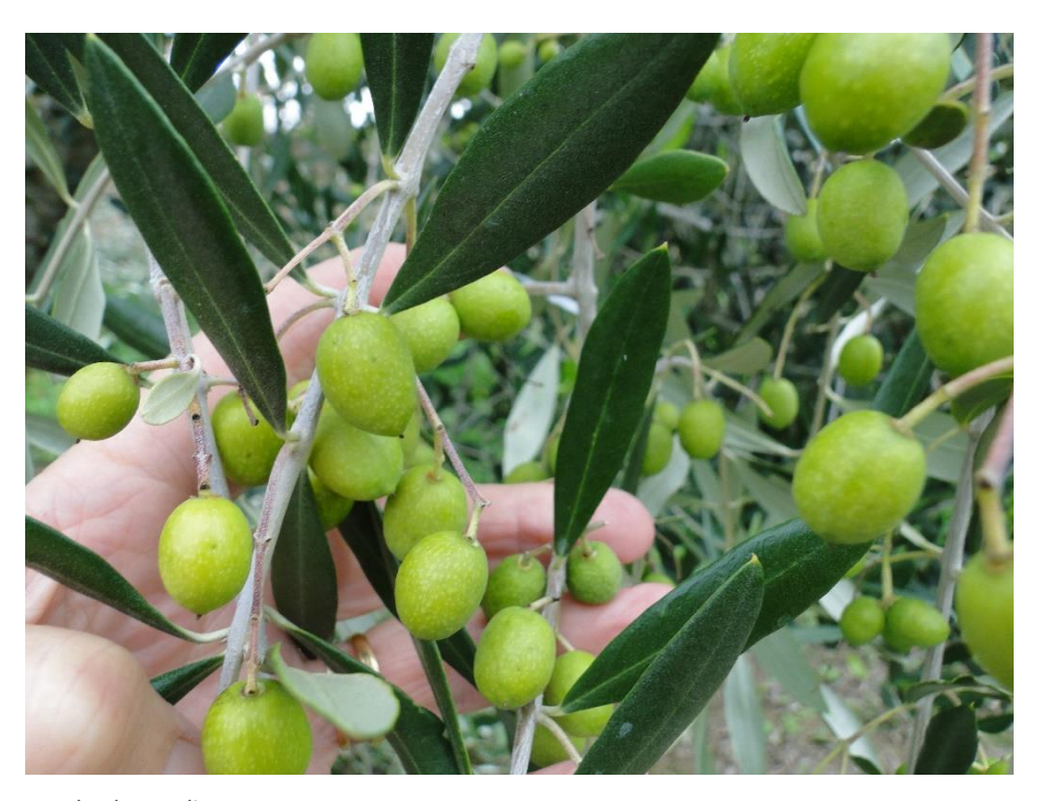
Lovely plump olives