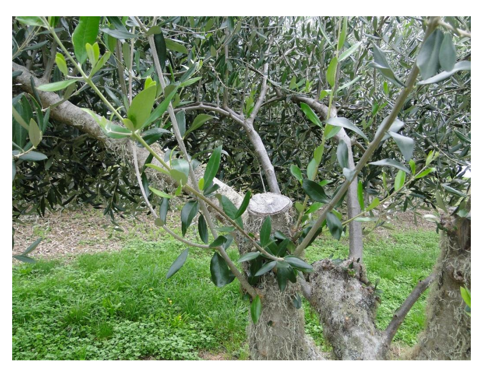
Good regrowth from pruning cuts