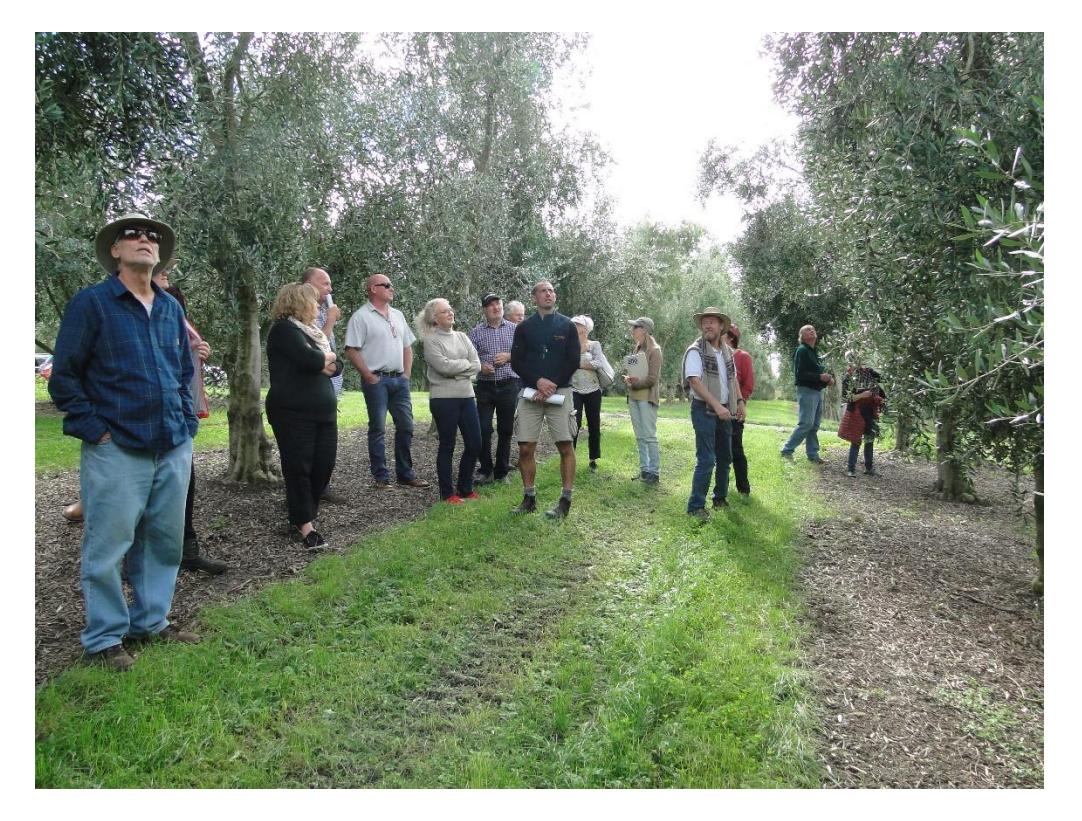
Out in the grove at Kakariki