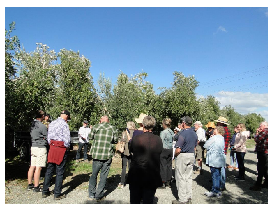
Out in the grove at Leafyridge