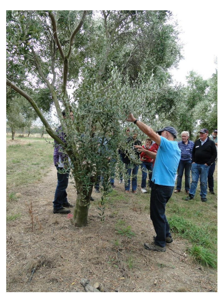
Discussing the vigorous growth and leaving the tree to select branches