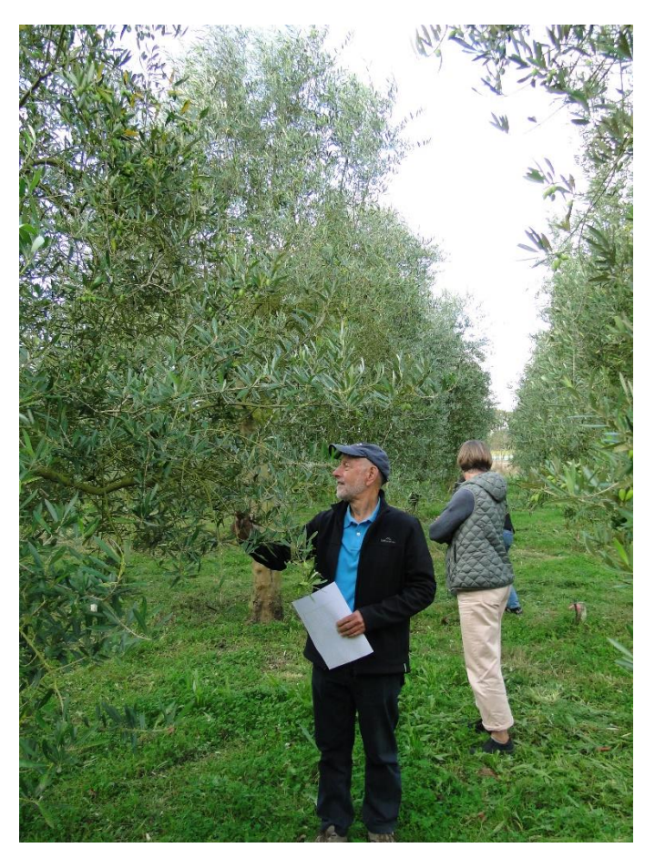
Some trees have a reasonable crop, others have nothing