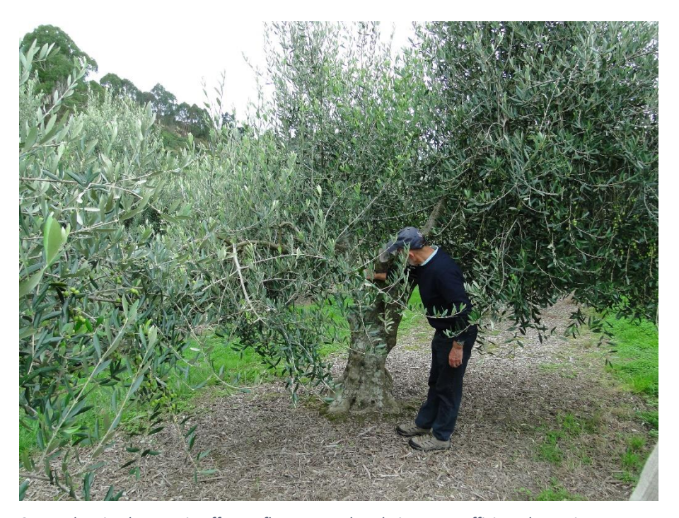
Stuart showing how to rip off superfluous growth as being more efficient than using pruners