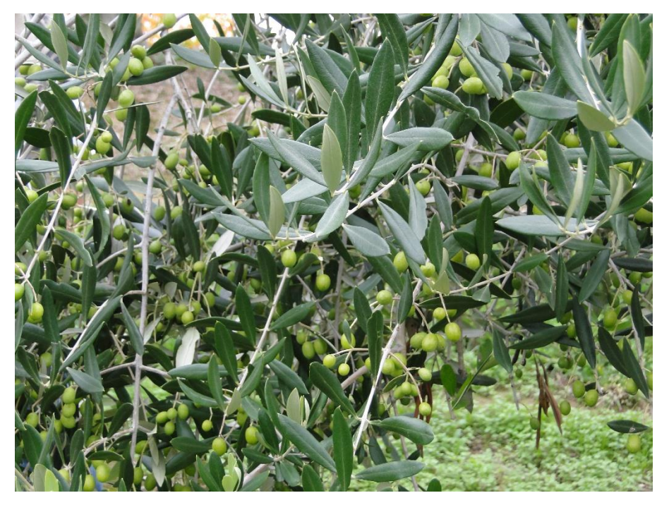
Pleasing crop load at Neudorf