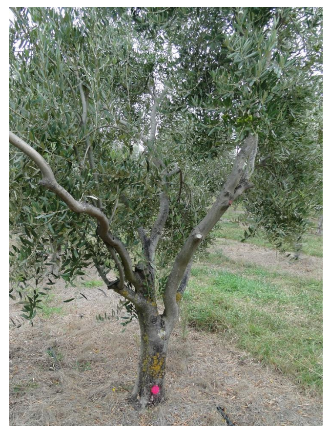
Revisit this tree for October prune R13 tree3