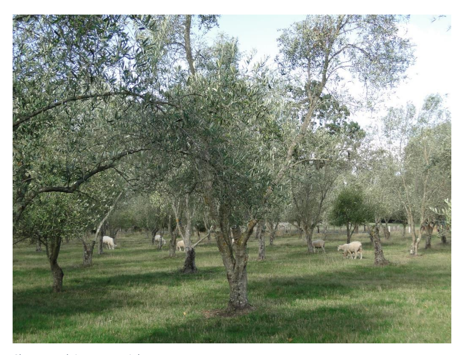
Sheep are doing a great job