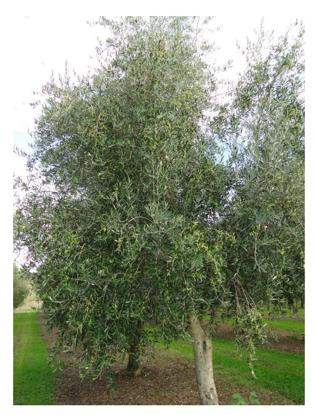
Pruned for machine harvest