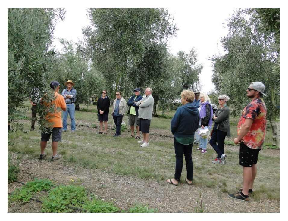
Attentive audience at Ngatarawa