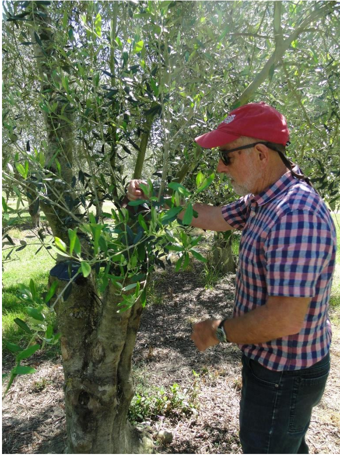
No sign of disease