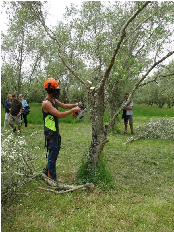
Main limbs removed