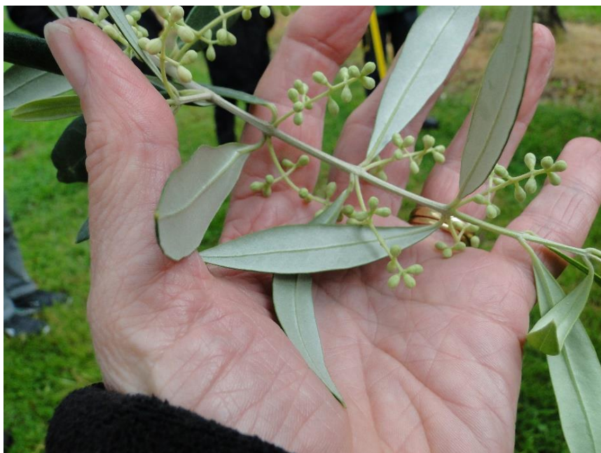
Impressive flowering at Olives on the Hill