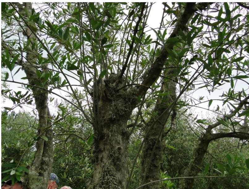
Good regrowth but lichen apparent