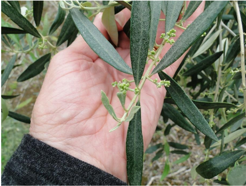
Flowering at Leafyridge