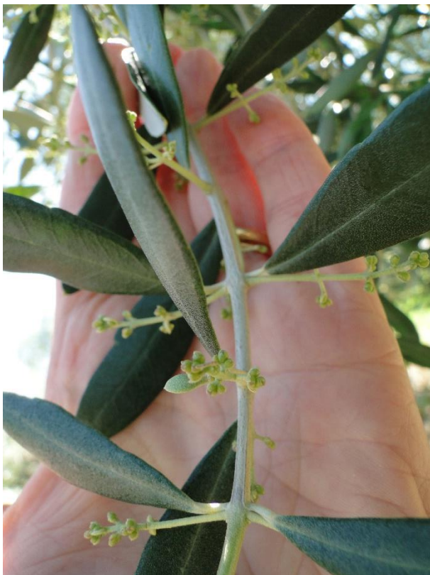
Flowering at Kakariki