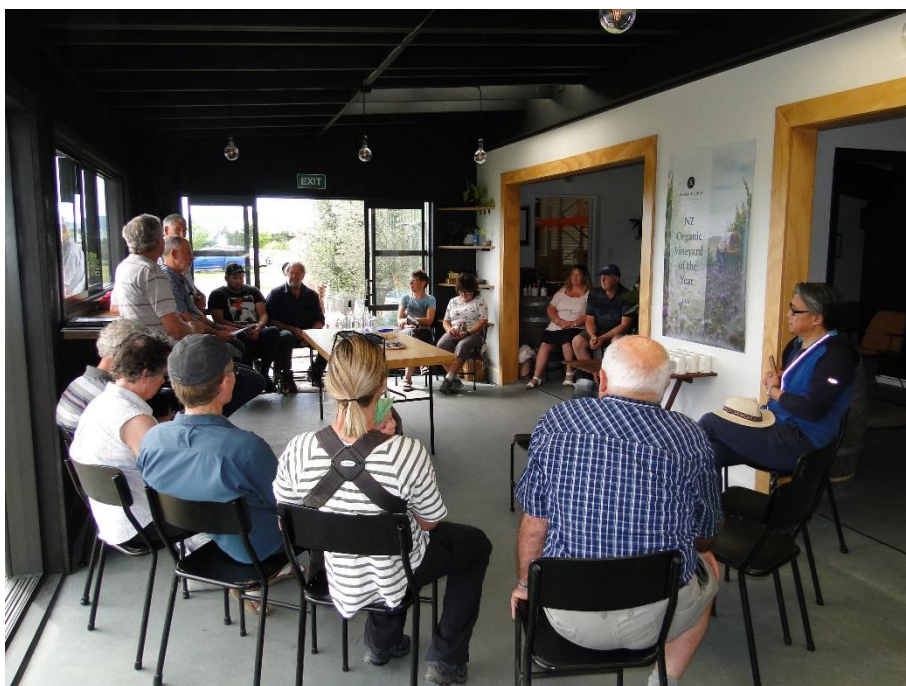
Discussion time at Terrace Edge