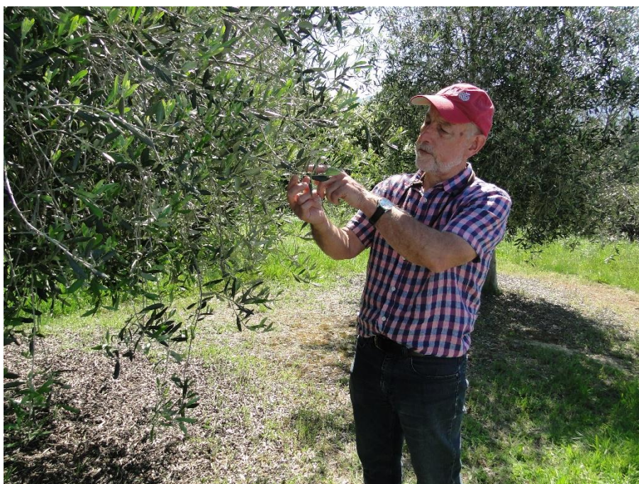
Stuart showing signs of Anthracnose and other disease