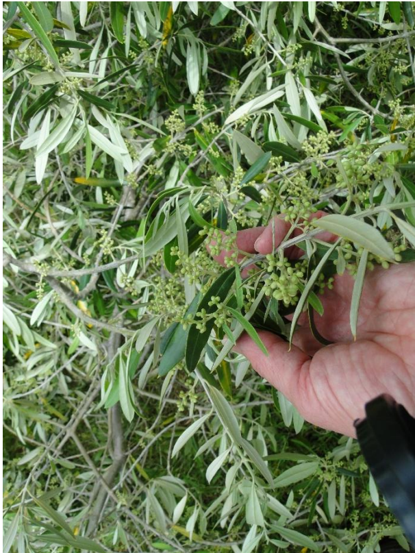
Some excellent flowering at Bella Olea but on pruned branches