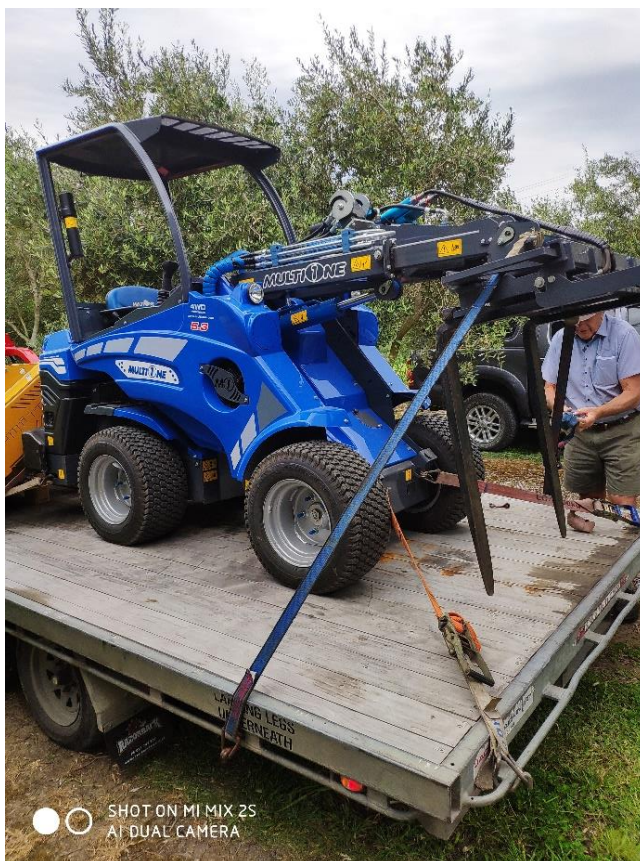
Multione Tractor from Jack's Machinery Ltd