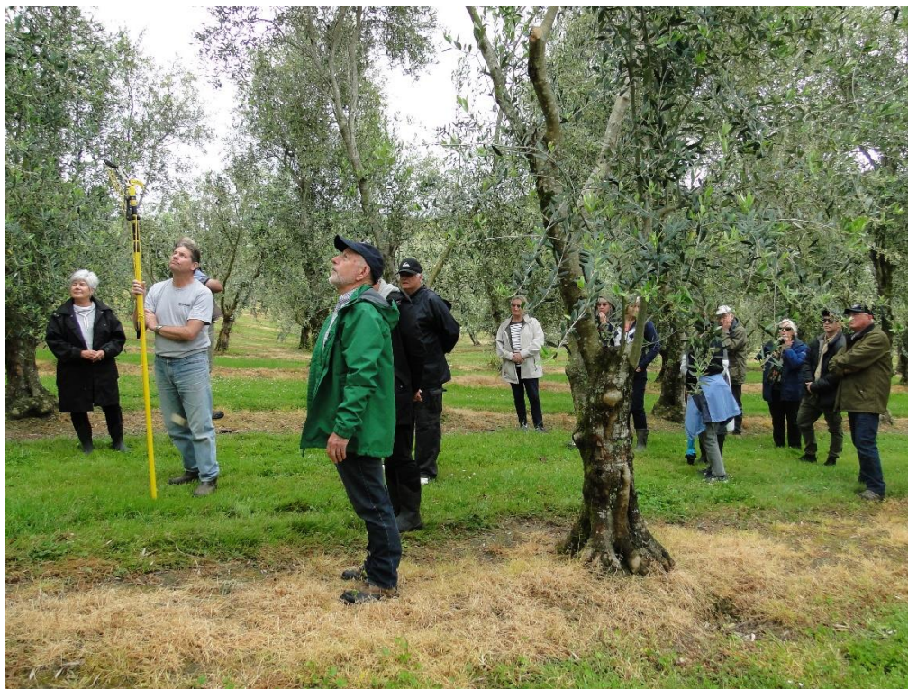
Out in the grove at Olives on the Hill