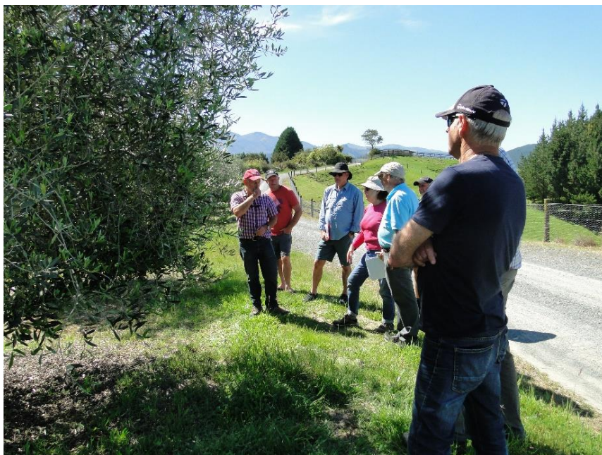
Out at the Gate Block at Weka Olives