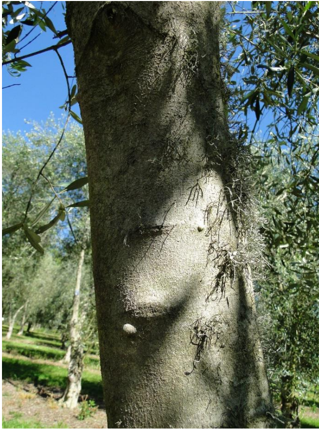
New buds are apparent