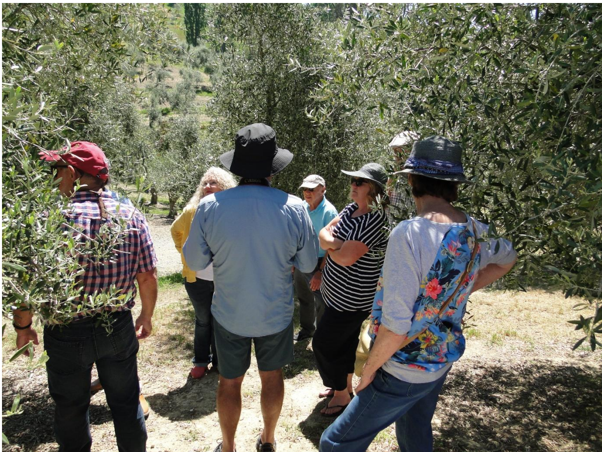
Neudorf Olives - out in the grove