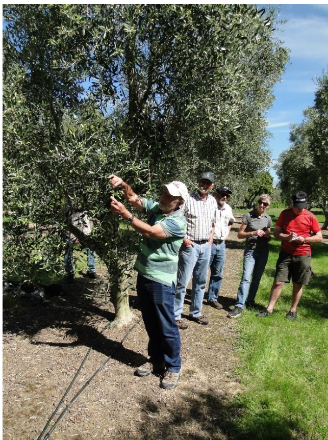
Showing where to take leaf samples