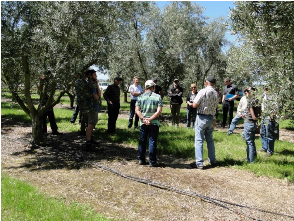
Out in the grove at Aquiferra