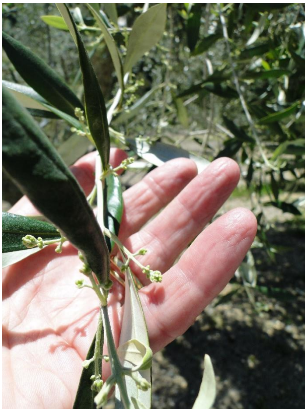
Flowering at Neudorf Olives