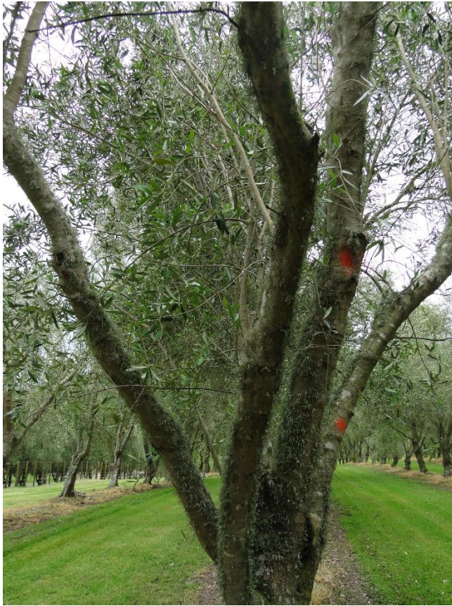
Lichen on most trees evident