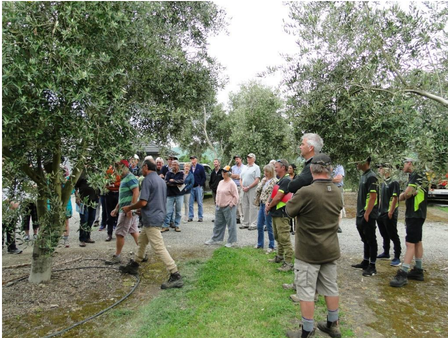
A great turn-out at Leafyridge Gove