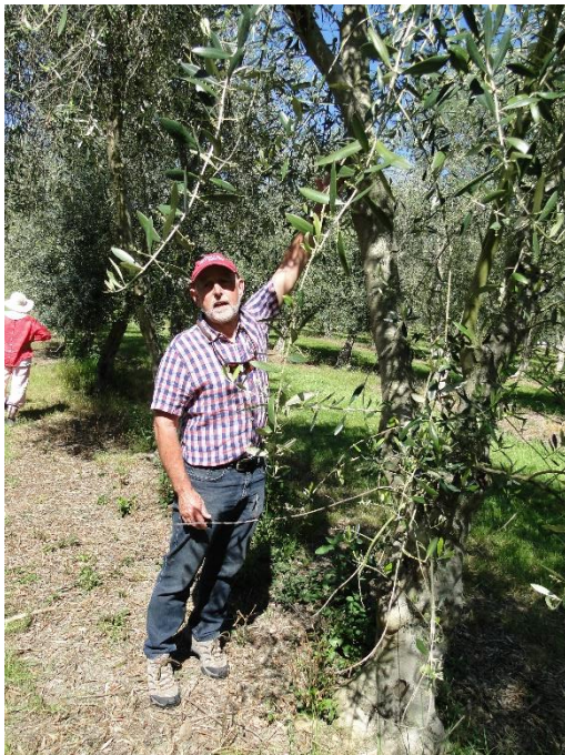
Healthy new growth