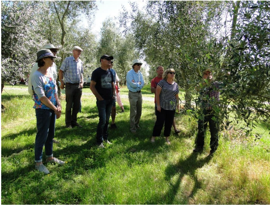
Out in the grove at Kakariki

The group then adjourned for lunch at the Moutere pub.