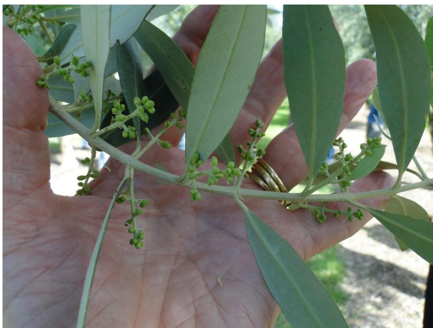
Flowering at Aquiferra