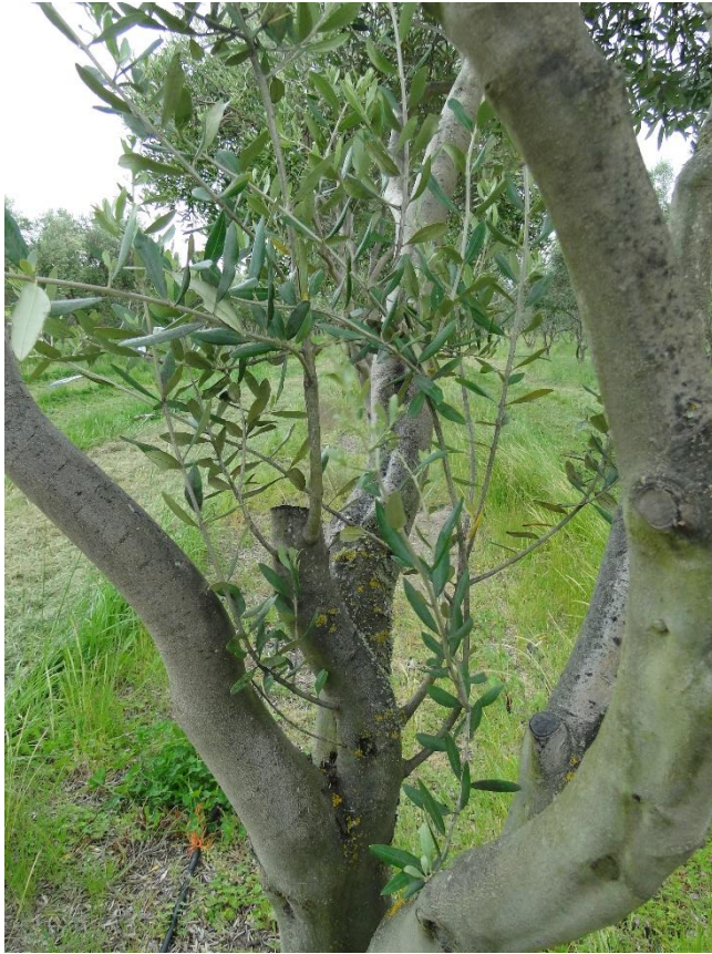
Good regrowth on previous cut