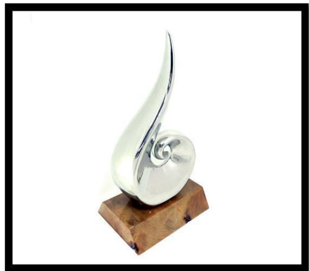
BEST BOUTIQUE - COSPAK TROPHY