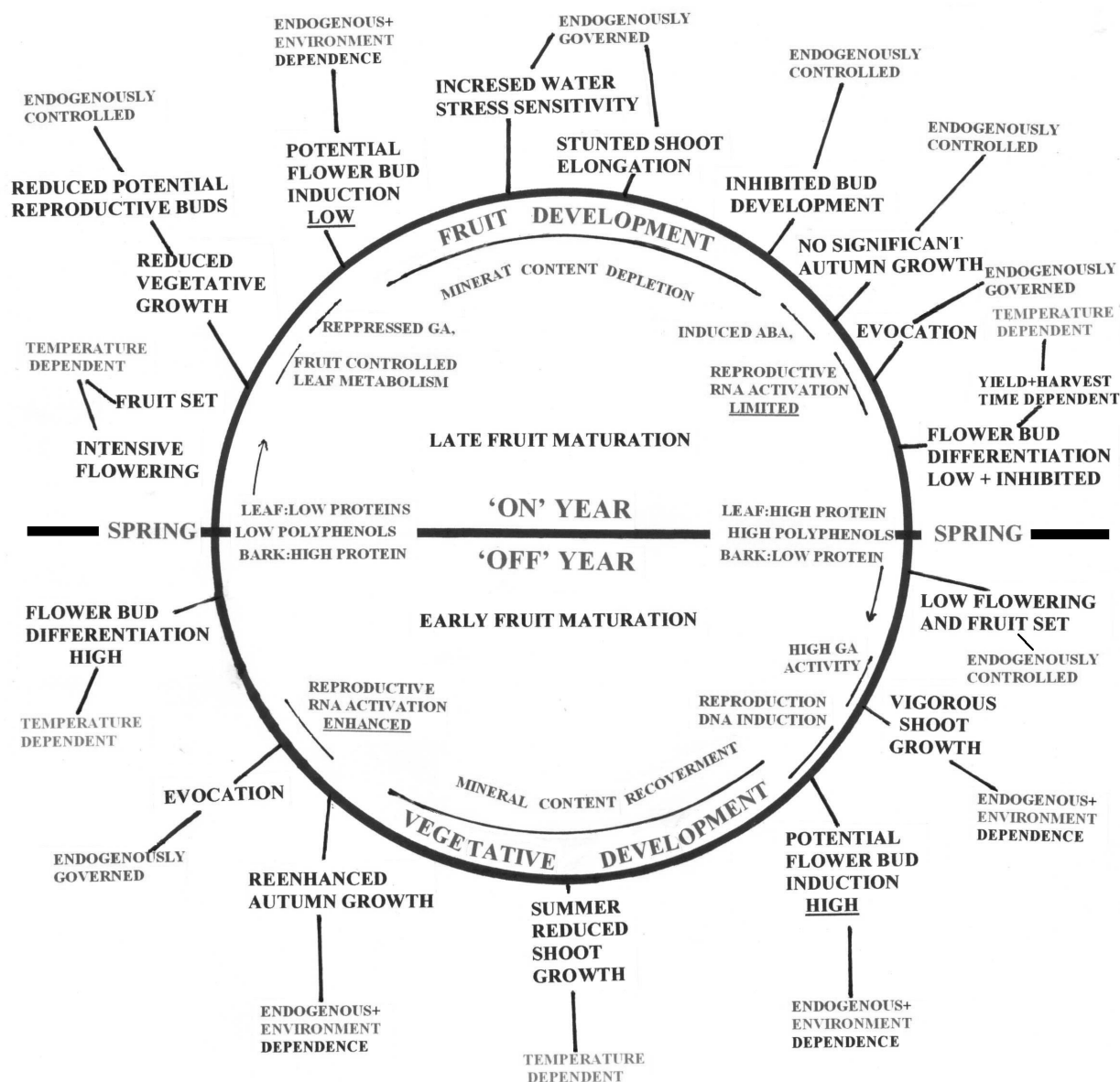
Fig. 3: A general scheme of the alternate bearing events, involvement of endogenous processes and interaction with the environment during an 'on' followed by an 'off' year (in black are the developmental stages, in red endogenous processes and in green environmental involvement).