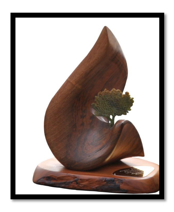
BEST IN SHOW - ANDY ROSANOWSKI MEMORIAL TROPHY